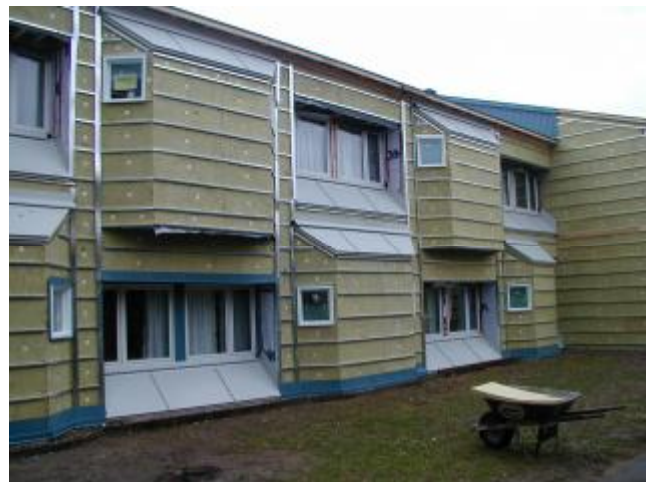
Figure 9: Installation of Rigid Insulation