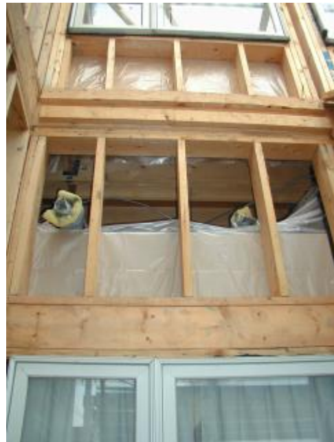
Figure 4: Discontinuous Poly Layer Between First and Second Floors

The walls were reconstructed by removing all exterior siding, sheathing and batt insulation. Repairs to the existing 6-mil polyethylene vapour barrier could not be completed due to complexity in the exterior wall design (Figure 4). Since a comprehensive air barrier could be constructed, all efforts were taken to ensure that it was achieved. A new redundant air barrier was constructed with sealed sheathing and a high permeance membrane. The high permeance membrane also acts as a secondary moisture barrier. Batt insulation in the stud cavity was replaced. Based on dynamic hygrothermal modelling by WUFI, additional rigid mineral wool insulation was installed outside the sheathing. Hours per year when conditions support mould growth on the inside face of the exterior sheathing were less than 1% in the analysis. Spray-foam insulation was installed in areas where the vapour barrier could not be reinstated. All of these techniques were aimed at increasing thermal resistance, reducing air leakage, and moisture penetration into the wall cavity, essentially reducing energy consumption and increasing resident comfort.