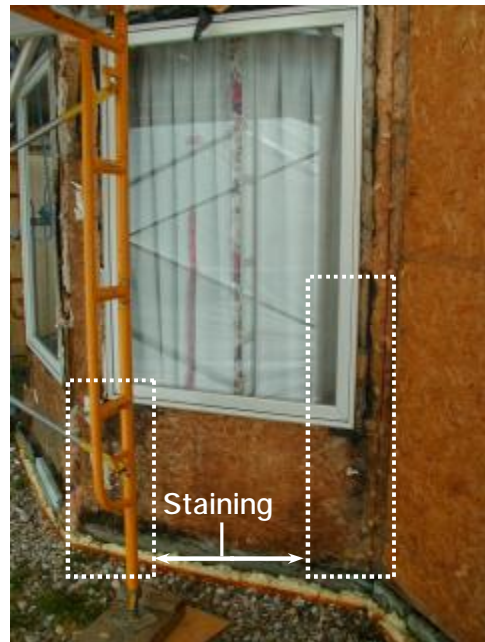
Figure 3: Stained Sheathing Around Windows

With no soffits, attics had isolated vents in the soffit over the second floor windows. Attic ventilation was poor and icicles formed. Due to lack of an adequate overhang, roof runoff fell to the ground either directly along the wall or by cascading over the shed roofs over the residential washrooms. Some of this water infiltrated the wall assembly through vulnerable areas at the shed roofs, windows, and joints in the siding, and backsplash at the base of the wall (Figure 3). Moisture also infiltrated the wall cavity from the building interior due to spillage of water in bathrooms, leakage from plumbing pipes, and condensation on pipes and exhaust ducts. Condensation in the exterior wall due to high interior humidity was most critical in the common assisted bath areas, where the majority of the fans were not functioning, and not vented to the building exterior. Whenever mould has been encountered since the building was completed, the City of Ottawa (and formerly the Regional Municipality of Ottawa Carleton) has taken immediate action to remove and remediate and conducted frequent air testing to ensure residents and staff were safe.