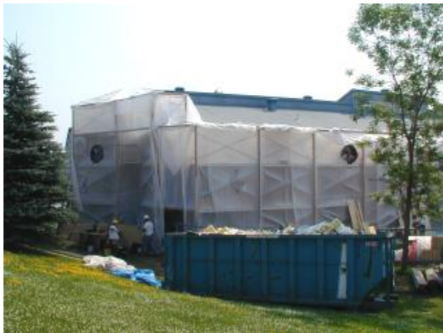
Figure 5: Tarp Enclosure

Carleton Lodge operates 24/7/365, caring for full-time higher risk residents, many confined to the building. The Lodge is fully occupied with a substantial waiting list. As a result, there was little opportunity to relocate residents overnight during construction. The project's greatest challenge was limiting disruption and noise, and separating the construction area from the residents. Interacting with the residents and staff with a high degree of sensitivity was essential for success of the project.