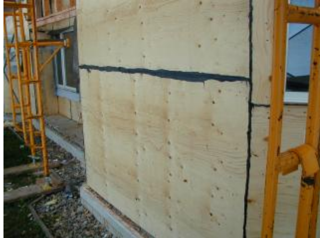
Figure 7: Sealed Joints in Sheathing

Vermin protection in the form of a 22 gauge L-shaped galvanized steel sheet 300mm in height was fastened to the sheathing at the base of the wall, and sealed with grout at its base (Figure 6).