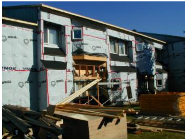
Figure 8: Tyvek Installed Over Sheathing