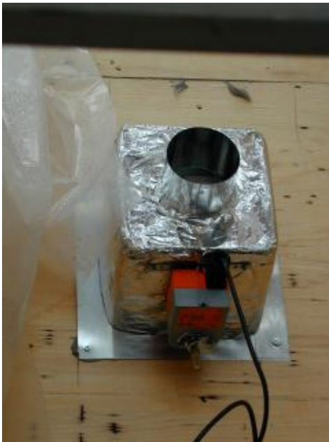
Figure 10: Installed Damper

The first of the roof enhancements was to install a 300mm extension to the roof eave around the perimeter of the residential wings to direct roof runoff away from the exterior walls. Existing shingles and sheathing were removed in the first 1200mm from the eave, and new framing spliced to the existing roof trusses. This new 1500mm section of roof was then protected with sheathing, self-adhered waterproof membrane, and roof shingles to match those on the existing roof. A vented soffit was provided, and insulation baffles installed to enable continuous attic ventilation along the roof eaves. Eavestroughing and downspouts were installed to direct water away from the building.