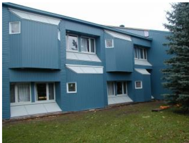
Figure 2: Retrofitted Building Elevation